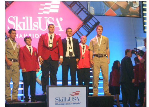
2012 National Carpentry Silver medal winner from Manchester Community College

SkillsUSA serves more than 320,000 students and instructors annually and answers the call of American industry by helping to produce better-prepared employees for the technical workforce. The organization has 13,000 school chapters in 54 state and territorial associations. More than 16,500 instructors and administrators are professional members of SkillsUSA.