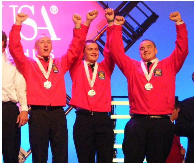
2012 National Automated Manufacturing medal winners from RW Croteau Center - Rochester

Find out more by visiting one of our sites: